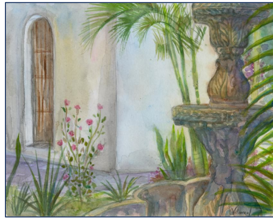
54. Corner Wall By Fountain