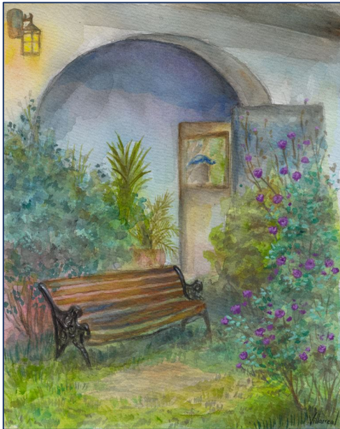
53. Museum Garden Bench