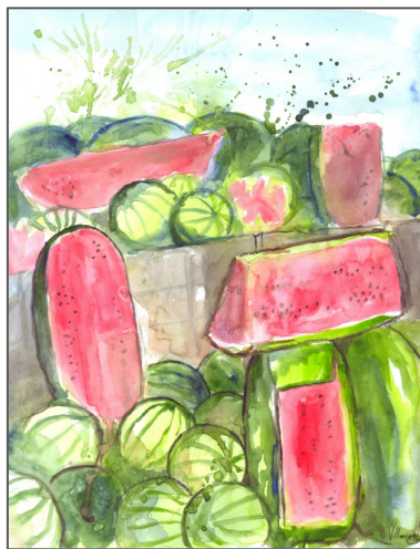
41. Watermelon Stall

I expected to take a lot of pictures while visiting my friend in Guadalajara and going places with him. That's exactly what happened. The photograph that inspired me to paint 42. was one of the many photographs I took during my working holiday in April 2022. The five paintings that appear in set 38-42. are my first of several of paintings that were inspired by my exciting and rejuvenating travels to Guadalajara. I hope you enjoy them.