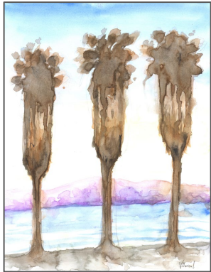
38. Sentinels by the Lake