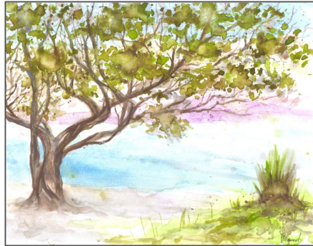
39. Gnarled Tree By Lake